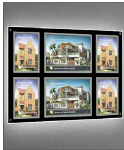
A4 Portrait & A3 Landscape