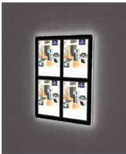
A4 Pocket - 2h x 2w