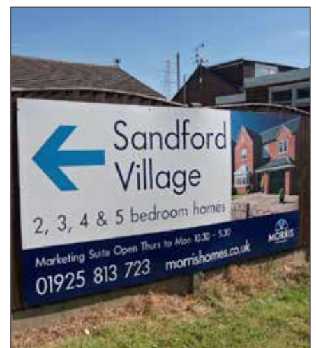
Off Site Marketing