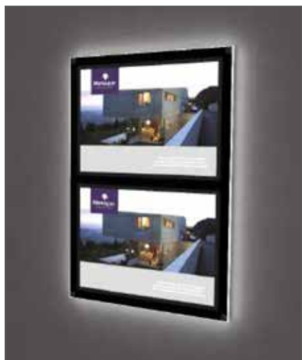
A3 Landscape - 2h x 1w