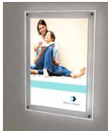
Clear 8mm panel plus glow edges