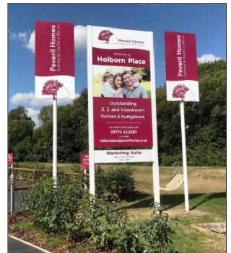
Main / Pre-Site Marketing