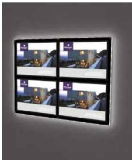
A3 Landscape - 2h x 2w