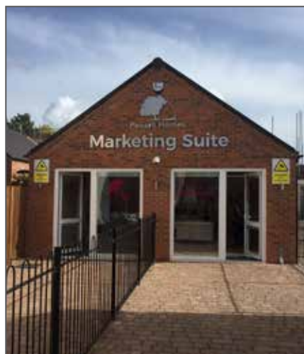
Marketing Suite Signage